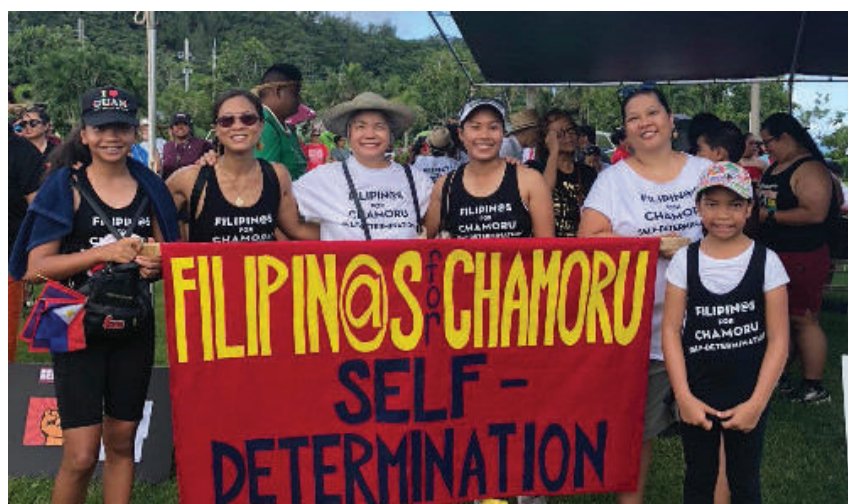
Local organization Filipinos for Guåhan at the 2019 Fanohge March for CHamoru Self-Determination.

Those people who came to Guam before the signing of the Organic Act of Guam (1950) and were not afforded U.S. citizenship because of their prior political affiliations or other circumstances, and those who came to Guam after 1950 and are also not defined as native inhabitants of Guam, do not have the right of Self-determination under Guam law. Choosing to immigrate to Guam is also choosing to live under the laws of Guam. Although this group of people is still subject to the United States’ colonial authority, this subjugation was not forced upon them without choice in the way that it was for the native inhabitants of Guam.