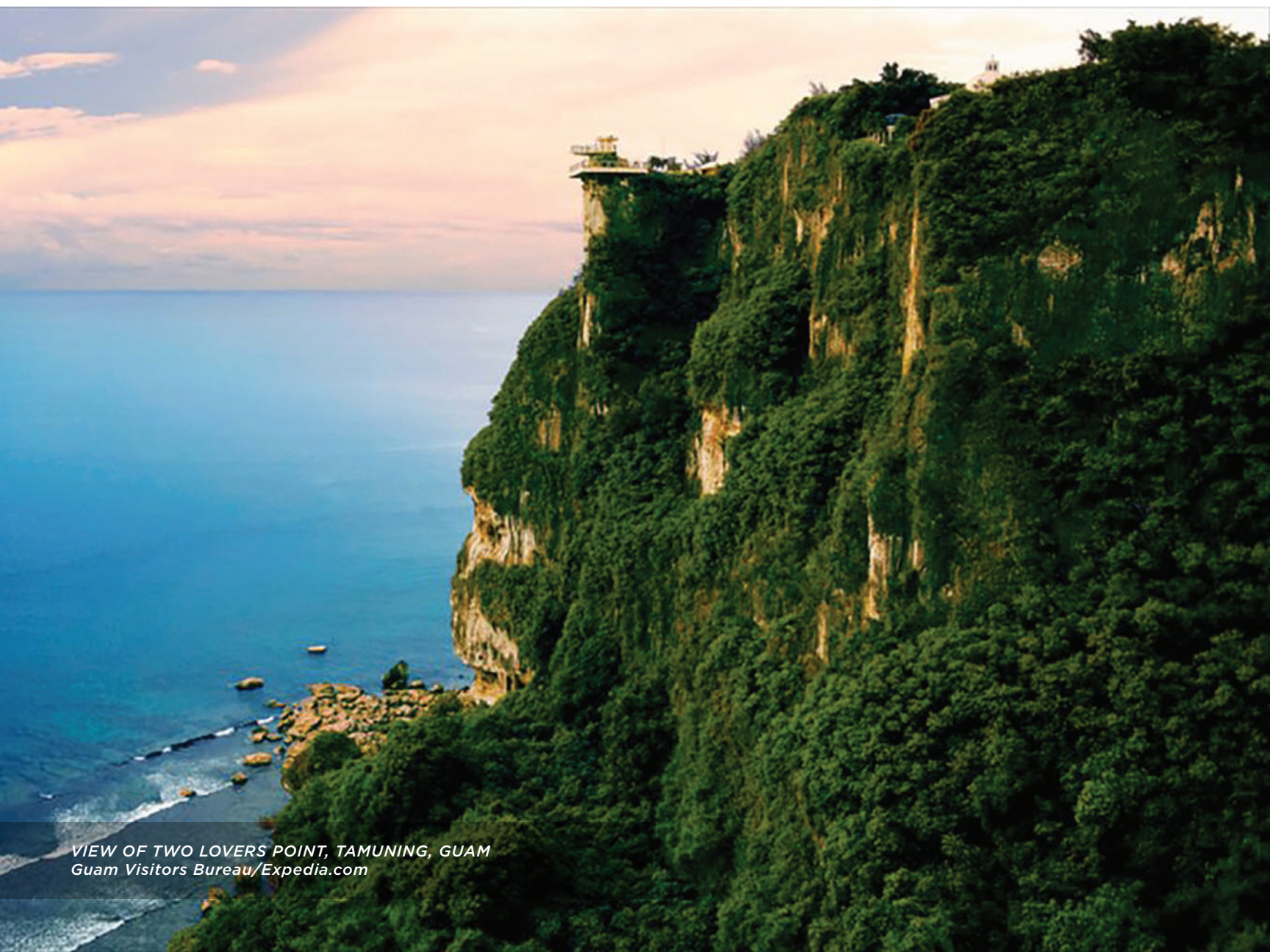
VIEW OF TWO LOVERS POINT, TAMUNING, GUAM

Guam is unlike any other place and there is no perfect model for us to follow or imitate. We have clearly outgrown our unincorporated Territory status, and further improvements under the current status quo are not enough to fix the inequity of our relationship with the United States. A fully Self-governing status is the only way to empower the people of Guam to protect our own interests and make decisions that are right for us.