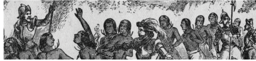
SPANIARDS ENSLAVING THE NATIVE AMERICANS

As an unincorporated Territory, Guam does not possess sovereignty at the international level, nor does it possess state sovereignty within the U.S. federal system. This lack of sovereignty over both its external and internal affairs has been a point of contention throughout Guam's history. With the Guam Commonwealth Draft Act, the United States opposed the inclusion of a mutual consent clause which would have given Guam a form of state sovereignty. This lack of sovereignty makes Guam powerless to federal decisions and prevents it from engaging in foreign affairs. This implies that Guam is subject to the authority of higher or outside powers that can make decisions that are not in the best interest of the island.