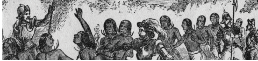
SPANIARDS ENSLAVING THE NATIVE AMERICANS

As an unincorporated Territory, Guam does not possess sovereignty at the international level, nor does it possess state sovereignty within the U.S. federal system. This lack of sovereignty over both its external and internal affairs has been a point of contention throughout Guam's history. With the Guam Commonwealth Draft Act, the United States opposed the inclusion of a mutual consent clause which would have given Guam a form of state sovereignty. This lack of sovereignty makes Guam powerless to federal decisions and prevents it from engaging in foreign affairs. This implies that Guam is subject to the authority of higher or outside powers that can make decisions that are not in the best interest of the island.