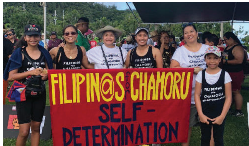
Local organization Filipinos for Guåhan at the 2019 Fanohge March for CHamoru Self-Determination.

Those people who came to Guam before the signing of the Organic Act of Guam (1950) and were not afforded U.S. citizenship because of their prior political affiliations or other circumstances, and those who came to Guam after 1950 and are also not defined as native inhabitants of Guam, do not have the right of Self-determination under Guam law. Choosing to immigrate to Guam is also choosing to live under the laws of Guam. Although this group of people is still subject to the United States’ colonial authority, this subjugation was not forced upon them without choice in the way that it was for the native inhabitants of Guam.