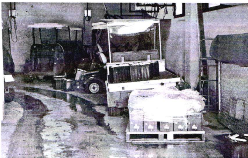
The Guam International Country Club in Dededo was cited yesterday by the Occupational Safety and Health Administration for a number of safety violations in their maintenance shop.

Among the serious safety violations are failing to: provide training for employees working with hazardous materials; provide appropriate personal protective equipment for eyes and face; provide required forklift training and ensure the forklift had a functioning seatbelt; in addition to multiple electrical