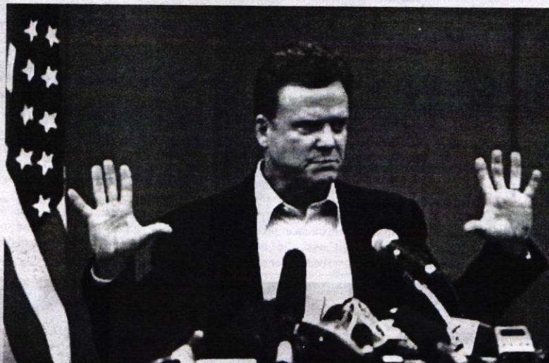
Senator Jim Webb has expressed concerns over what he called the "unexplained delay in contracting an independent study of U.S. security interests."

In questioning DOD officials, Webb asked: "I remained to almost the end of this hearing because I was quite surprised, Secretary Mabus, to hear your response with respect to the